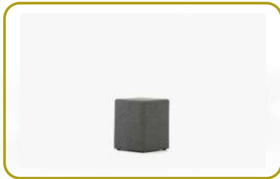
Brick Cube Unit, 400x400mm

In accordance with EN 15804+A2 and ISO 14040 / ISO 14044