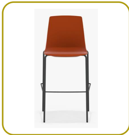
Arlo High Stool

In accordance with EN 15804+A2 and ISO 14040 / ISO 14044