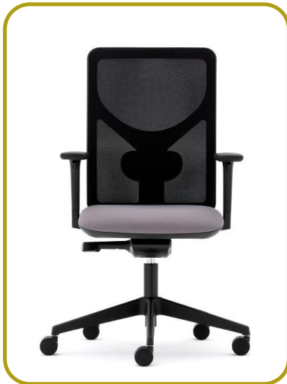
Pluto Plus Mesh- PPM90HA

In accordance with EN 15804+A2 and ISO 14040 / ISO 14044